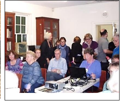
More chairs please!