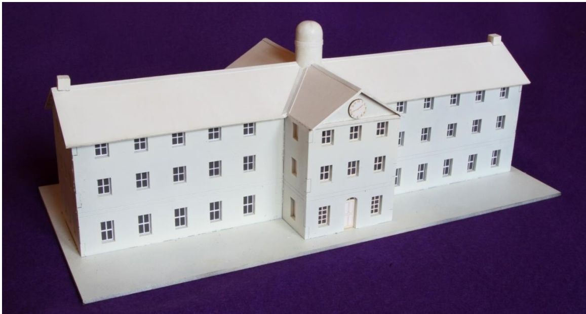
The exquisitely detailed Fitzell-Mathews model of the Main Factory Barracks (c1818) currently featured in the Herstory Exhibition at Hambledon Cottage.