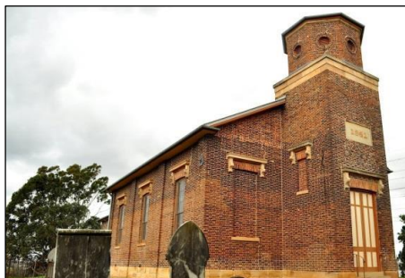
St Bartholomews Church, Prospect c1841