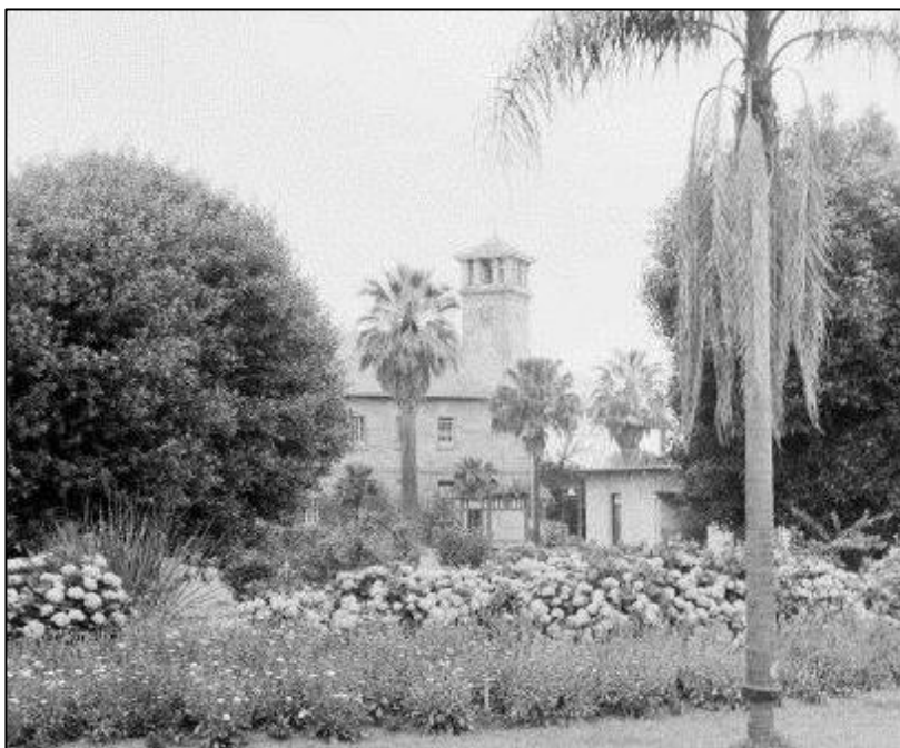
Front gardens along Greenup Drive by E.W. Searle, c 1935. Source NLA (vn4654261-v)

May the gardens bloom again and weave their ‘curative’ spell for the community and visitors to a World Heritage site and world class Museum Precinct! RG.