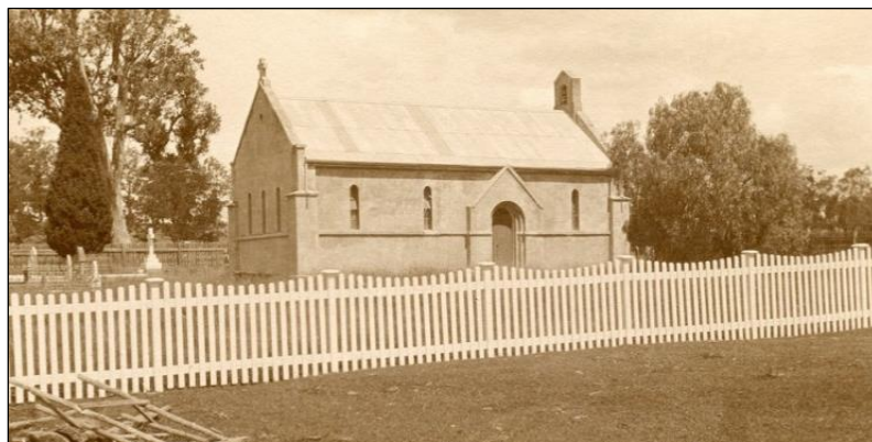
St Phillips Anglican Church, Warkworth c 1848

WELL MAY WE GRIEVE WHO LAID THEM THERE WHERE WILL WE FIND THEIR EQUAL WHERE