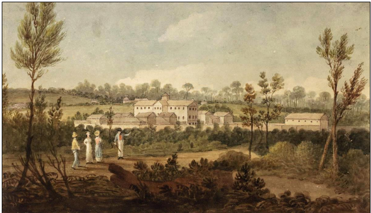
The Parramatta Female Factory - Augustus Earle 1826

Facebook: https://www.facebook.com/parrafactory/