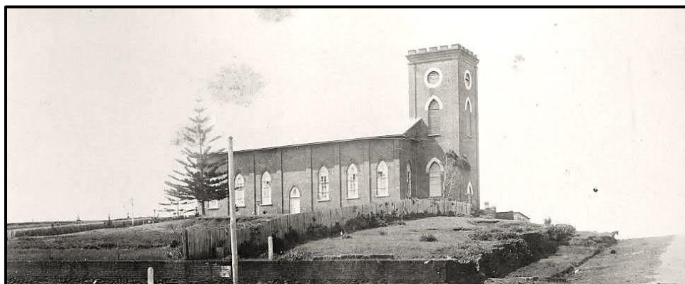
St Thomas’ Anglican Church, Port Macquarie – built by convict labour 1824-1828