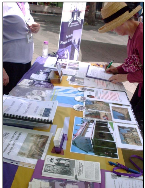
A sample of goods for sale and publicity/advocacy material at the PFFF stall in Centenary Square in December 2016 – NPRAG “Hands Off Our Assets” Rally.