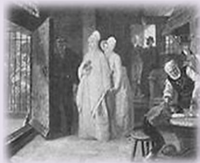
Image: Mrs Fry visiting Newgate Prison