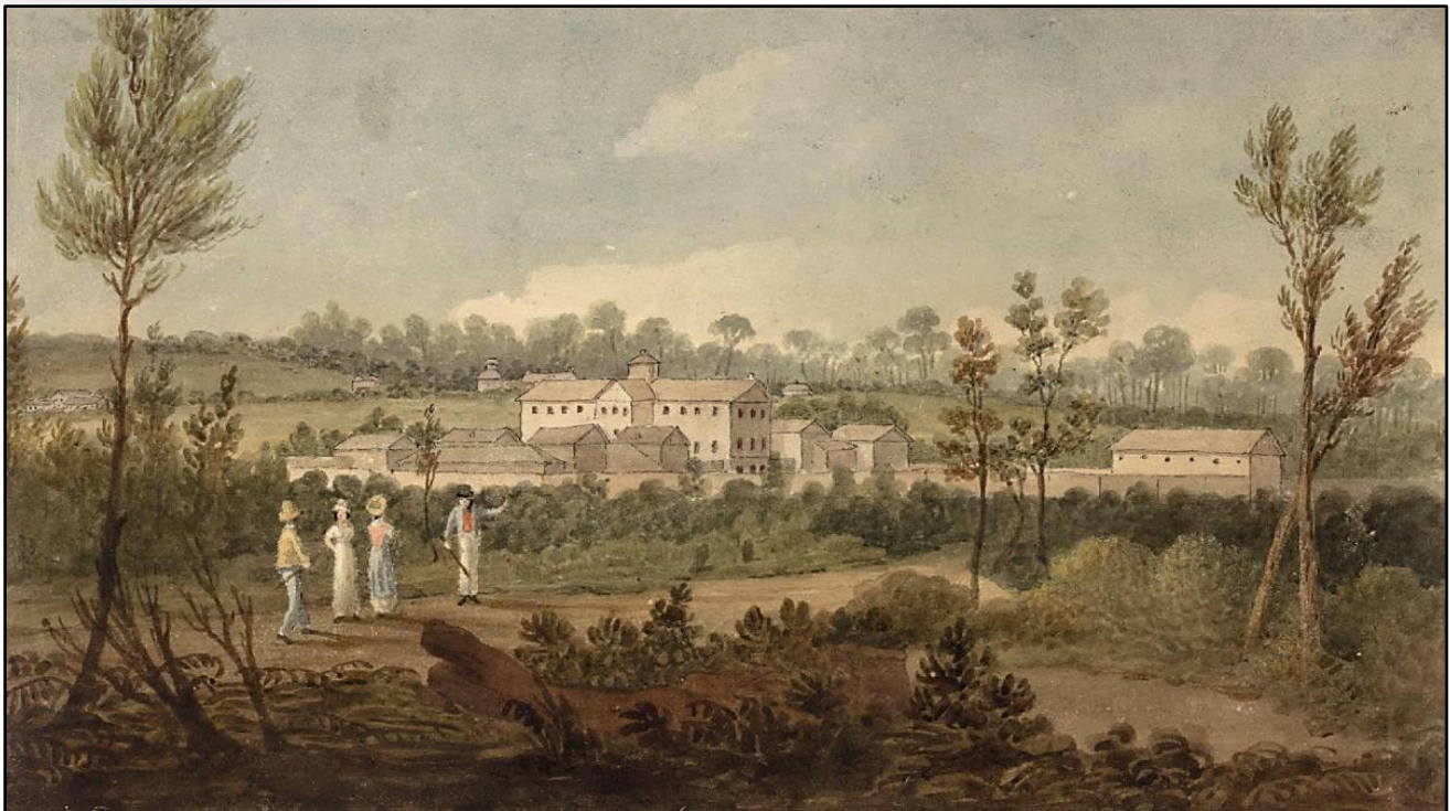
The Parramatta Female Factory - Augustus Earle 1826 – courtesy NLA

Contact: parramattafemalefactoryfriends@gmail.com or PO Box 1358 Parramatta 2124 Online petition and brochure/PFFF website: parramattafemalefactoryfriends.com.au History: parramattafemalefactories.wordpress.com