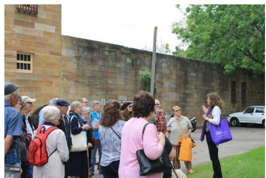
Riot Day – Gay with tour group - photo: Michael Rees