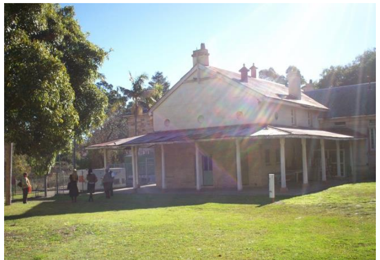
The 3 rd Class Sleeping Quarters c1821