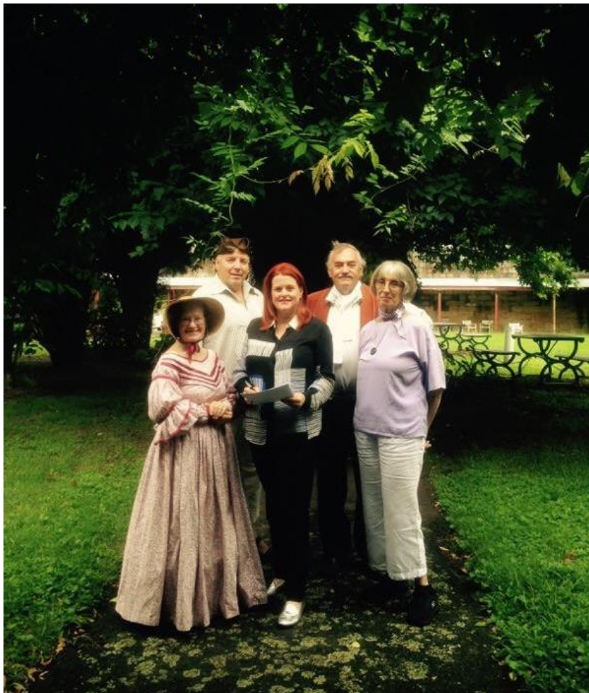
Some Likely Lads and Lasses behind the factory walls!

The event was well covered in the Parramatta Advertiser (10 th February 2016 edition) under the headline ' Battlers Unite to Save Precinct '! (1)