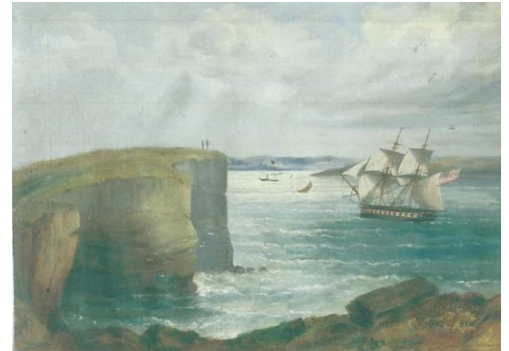
Image: entering Pt. Jackson c1800