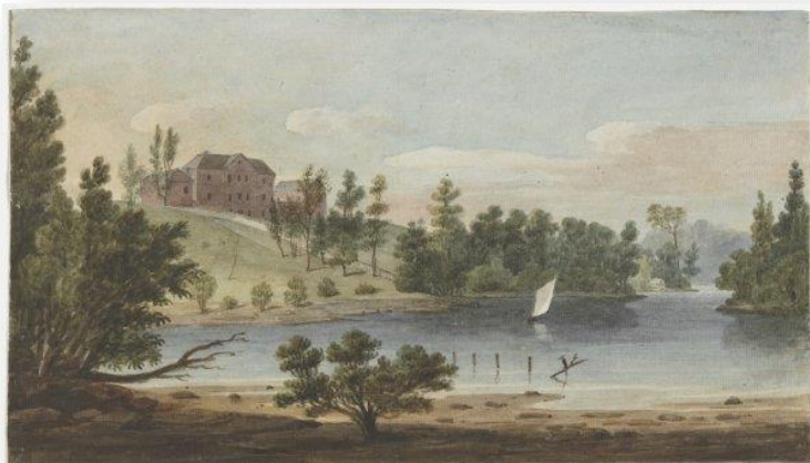
The Female Orphan School - Augustus Earle