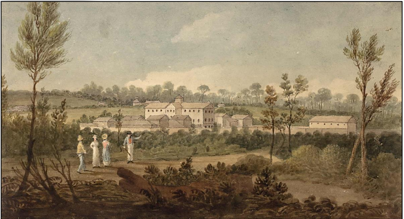
The Parramatta Female Factory - Augustus Earle 1826

Contact: parramattafemalefactoryfriends@gmail.com or PO Box 1358 Parramatta 2124 PFFF website /online petition and brochure:: parramattafemalefactoryfriends.com.au History: parramattafemalefactories.wordpress.com